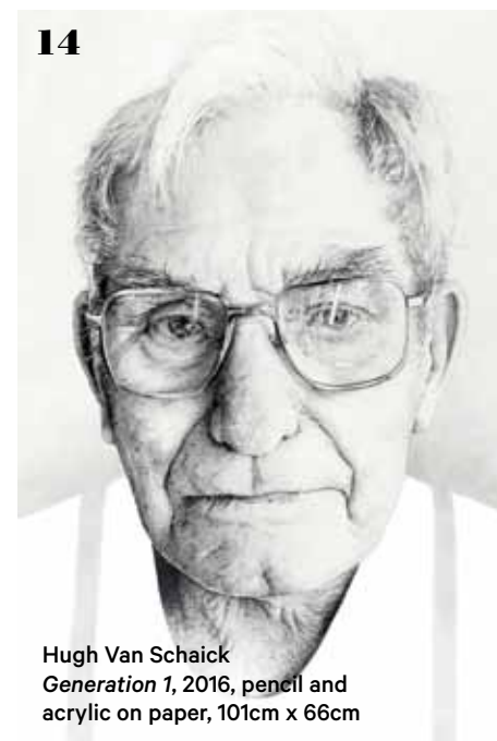
Hugh Van Schaick Generation 1 , 2016, pencil and acrylic on paper, 101cm x 66cm