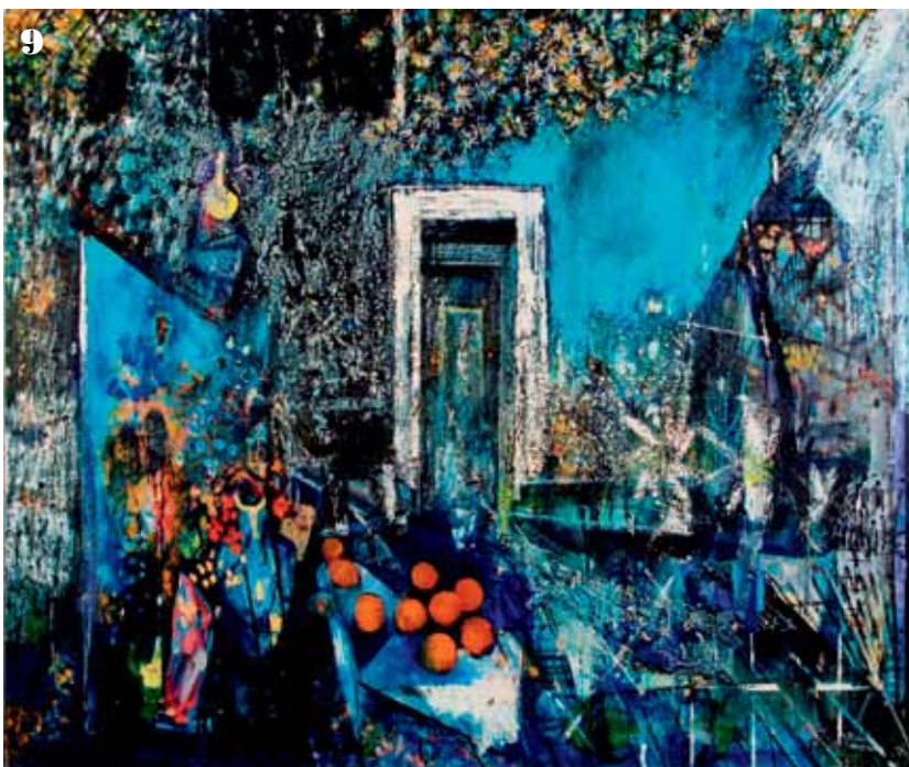
BOTTOM RIGHT Meg Cowell, The Passage (self-portrait), 2016, giclee print, edition of 5, 80cm x 80cm