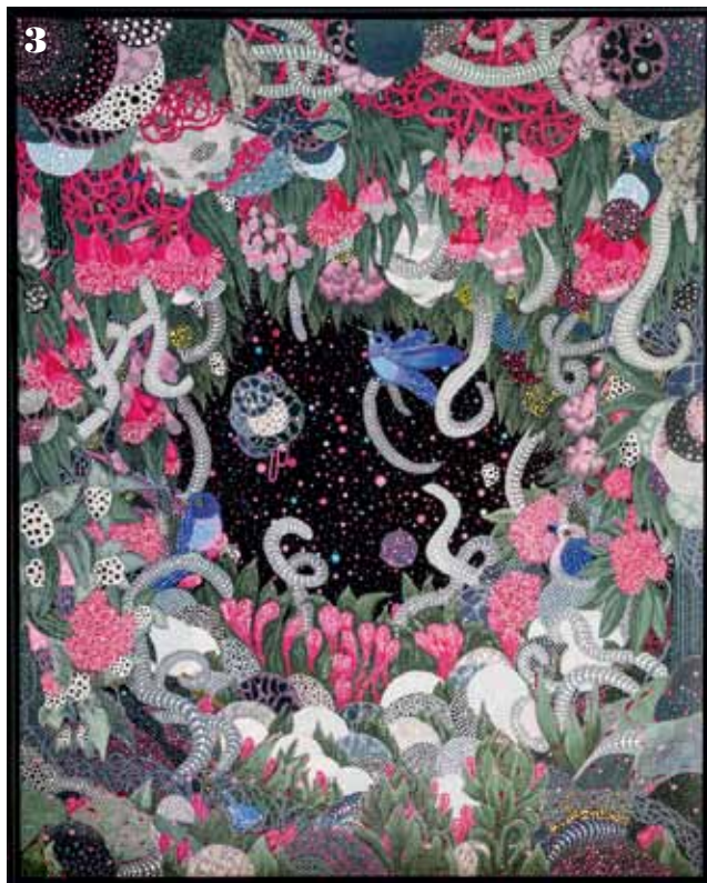
ABOVE Sally Paxton, Whereabouts , 2015, mixed media on canvas, 156cm x 126cm