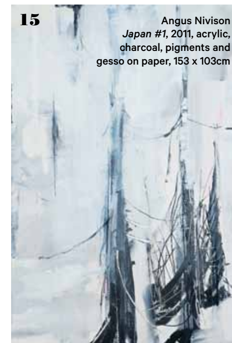
Angus Nivison Japan #1 , 2011, acrylic, charcoal, pigments and gesso on paper, 153 x 103cm