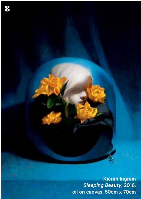
8 KIERAN INGRAM Still life is the primary focus of Kieran Ingram's work due to the control over composition and attention to detail afforded by this type of painting. He finds the relationship between specific objects particularly fascinating, especially when elements that seem incongruous can complement each other in surprising ways. The illusion in his work draws

from, but progresses beyond, the simple visual trickery of traditional trompe l'oeil and becomes conceptual when the relationship between objects alters how we perceive them.