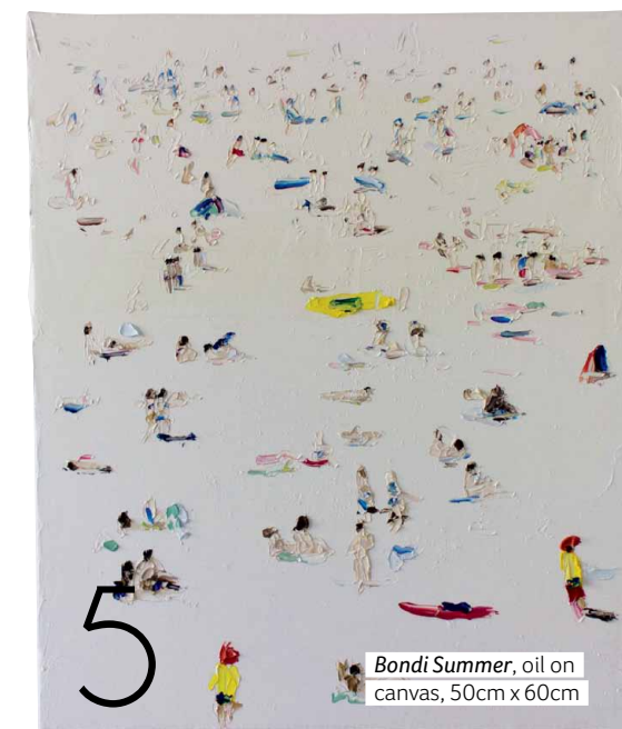
Bondi Summer, oil on canvas, 50cm x 60cm