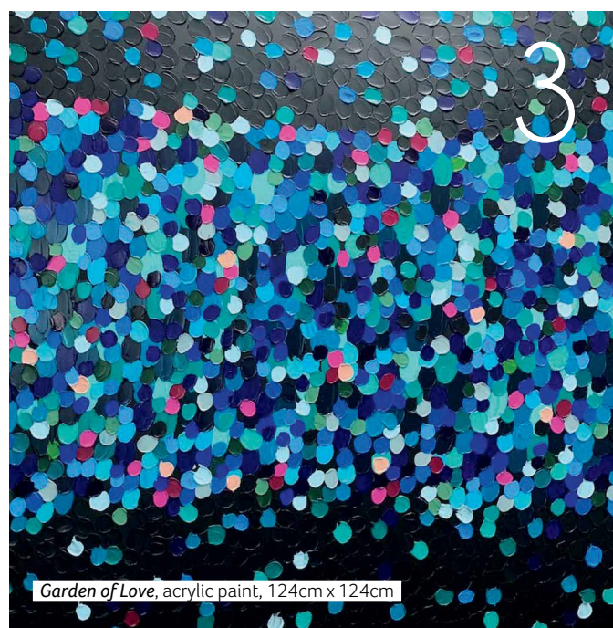
Garden of Love, acrylic paint, 124cm x 124cm