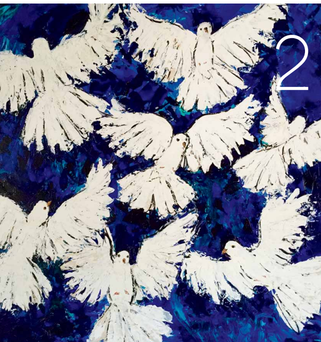
Seven White Doves, acrylic on canvas, 90cm x 90cm