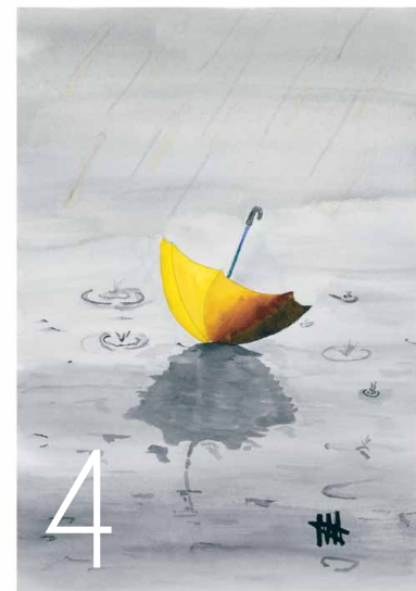
Left in the Storm, watercolour, 29.7cm x 42cm